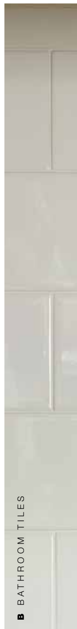
B BATHROOM TILES