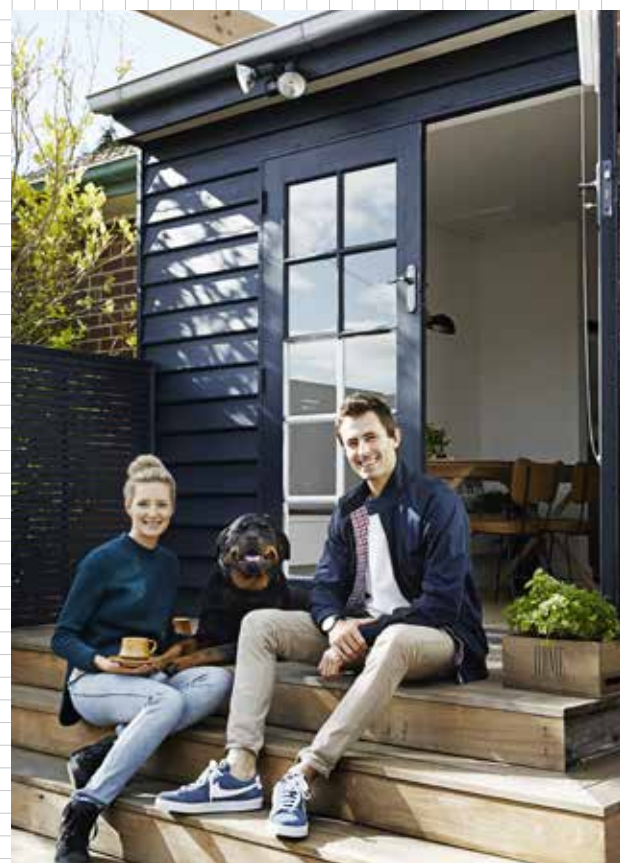
floorplan & still-life styling christina banos | photography sharyn cairns (lifestyle shots)

Black & white Dulux "Trespass" paint was chosen for outside, and Natural White for in. A mini herb garden is by Home By Danscapes.